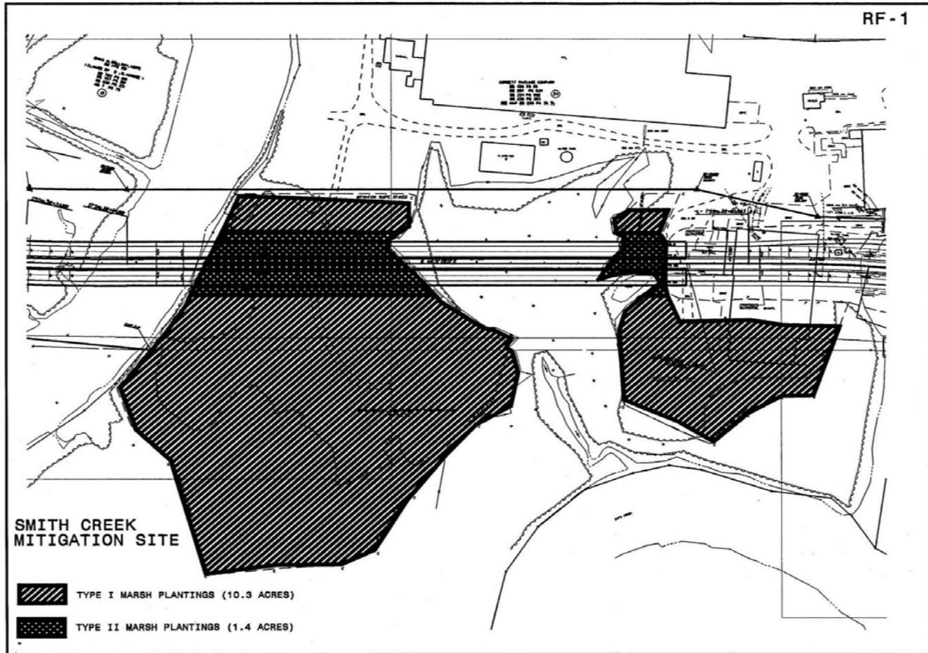
Figure 2. Site Location Map