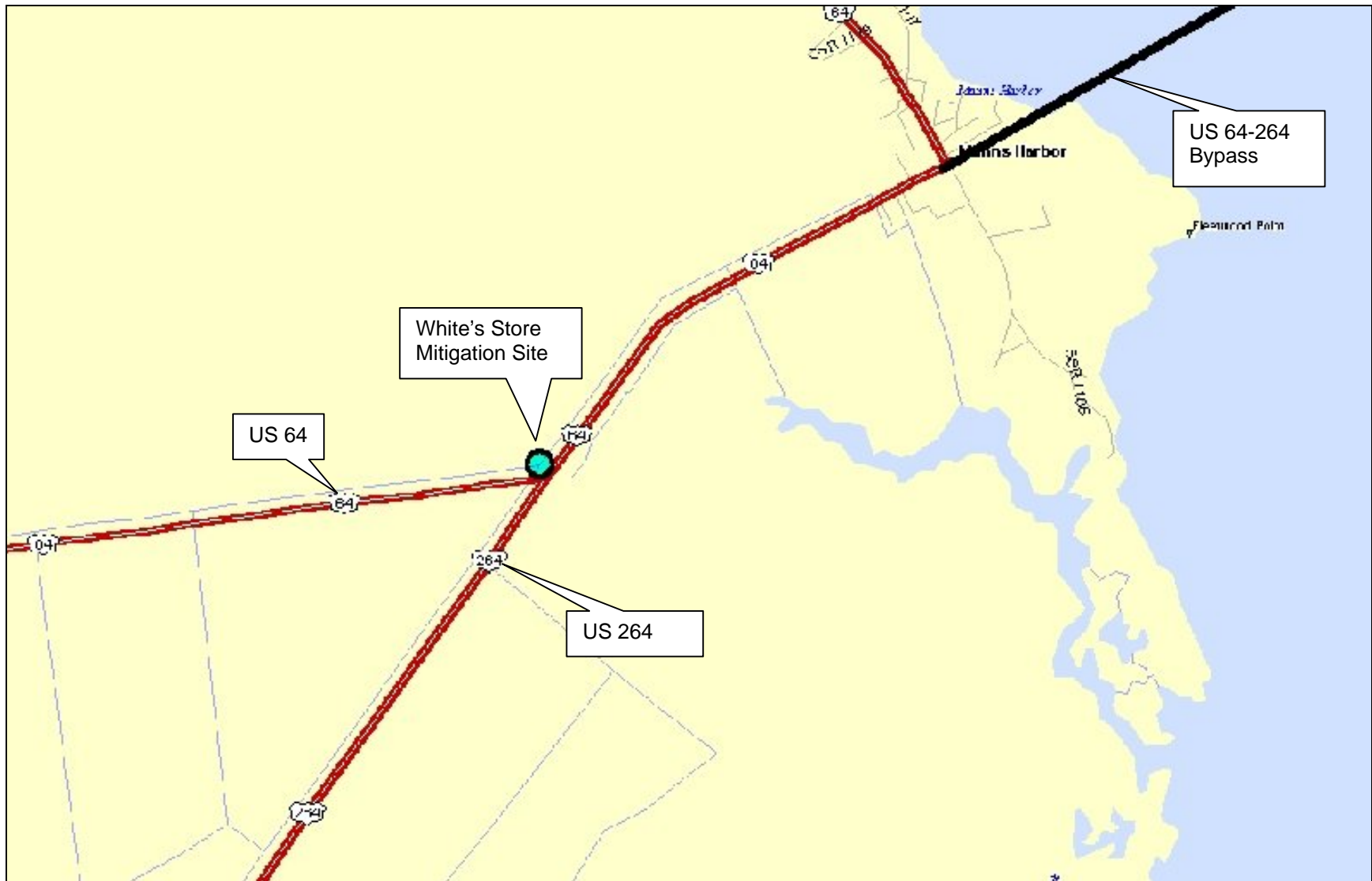
Figure 1. Site Location Map